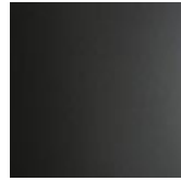
OP69 matt graphite