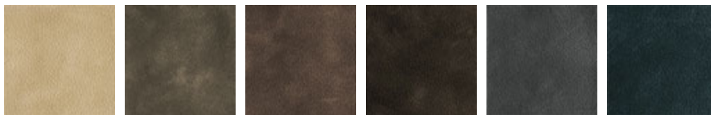
SN01 ZENZERO SN03 ARGILLA SN04 TERRA SN05 VISIONE SN06 VULCANO SN17 NOTTE