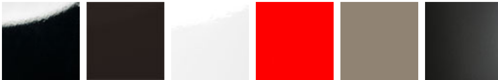
L3 polished black lacquered